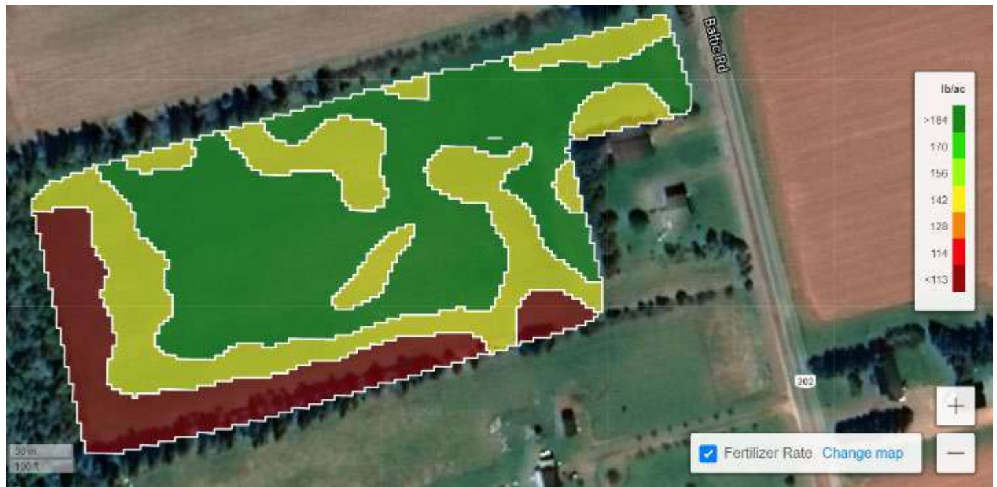
Fig. 2. Management zones for site-specific nutrient management and VR planting in Souris, PEI.